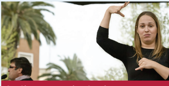
On-Site Interpreting Services

Our on-site interpreting services provide an experience that allow the Deaf consumer to be fully immersed in the discussions and activities happening around them. interpretek.com/services/community-interpreting